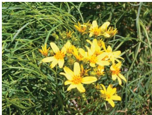
Ko'oko'olau Bidens menziesii subsp. menziesii Endemic