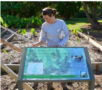
Mahalo to the Atherton & Leiter Family Foundation for underwriting this project.