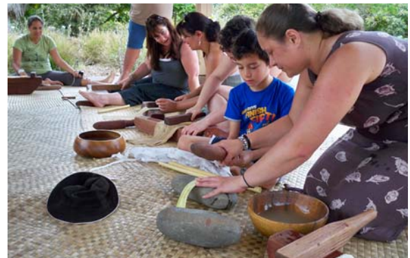
Pumanawa Rangatira of Poneke Aotearoa, Wellington, New Zealand toured MNBG and learned about kapa making just hours before their sold out performance at the Iao Theatre on August 18th. As you can see, it's never too early to teach our children the importance of Hawaiian traditions.