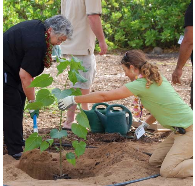
Honorable Mayor Charmaine Tavares plants a legacy tree at MNBG's Arbor Day 2009 celebration.

MNBG's annual Arbor Day 1,000 Hawaiian Tree Give-Away will be held on November 6th from 9 am – 12 pm at the Gardens. There will be an impressive selection of more than 30 native and Polynesian introduced species of trees to be given away free, one plant per person (any age). Event booths will have information about species selection; proper planting, pruning, mulching, and watering techniques for trees; pest identification; and locating trees to conserve water and energy. Set a day aside this year to plant a native Hawaiian tree and create a living legacy.