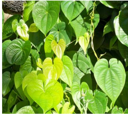
Uhi Dioscorea alata Dioscoreaceae (Yam Family) Polynesian Introduced