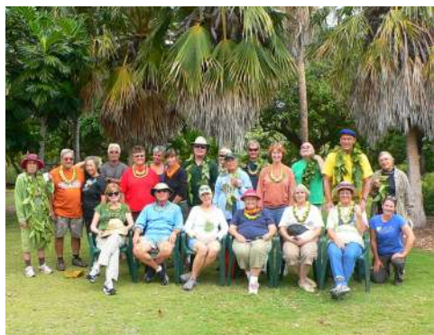
Kaunoa Senior Center spent a day at the Gardens learning about native Hawaiian plant propagation and lei making.