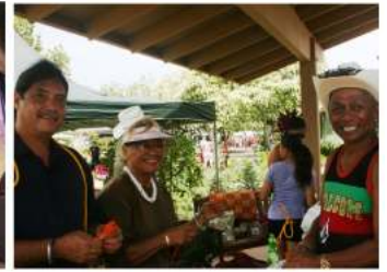
Mahalo to Nā Kamehameha Pā'u Riders for leading lei making demonstrations.