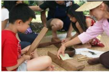
Kapa making activity at Earth Day 2013 led by UH-MC's Hawaiian Ethnobotany kumu and haumana.

Mahalo nui to the County of Maui's Department of Water Supply and KPOA 93.5 FM for advertising kōkua, and to our amazing volunteers for helping us achieve another great community event. No garden event would be possible without your unwavering dedication and support.