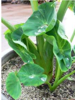
Kalo 'apuwai Colocasia esculenta Polynesian-introduced