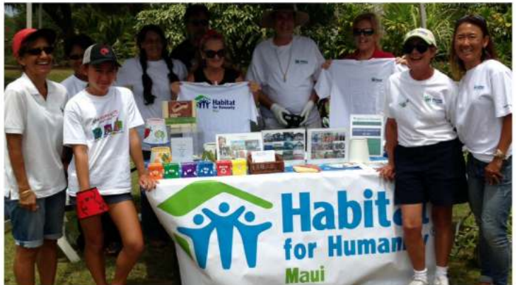
Mahalo to Habitat for Humanity and all participating organizations for sharing information at this year's event.