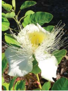
Maiapilo Capparis sandwichiana Endemic, Vulnerable