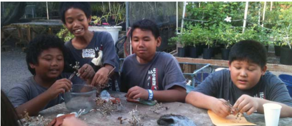
Volunteers from Maui Waena School help process seeds in the MNBG nursery.

We need seeds!! MNBG has put out a call to all conservation organizations interested in participating in this year's Arbor Day Celebration to help us by collecting a few native tree seeds from their lands. To encourage visitors to this year's 1,000 Hawaiian Tree Give Away to interact with the conservation organizations, all native trees will be given away from the participating organizations' booths rather than from a separate area as was done in the past. To help visitors make the connection between the tree they are taking home and the organizations that help preserve Maui's wild areas, we would like some of the trees to be grown from seeds that came from lands managed by those organizations. So far,