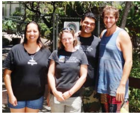
Aloha from the MNBG Staff!