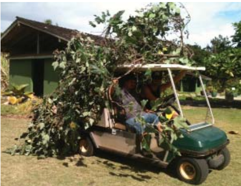
Tree trimming day at MNBG.