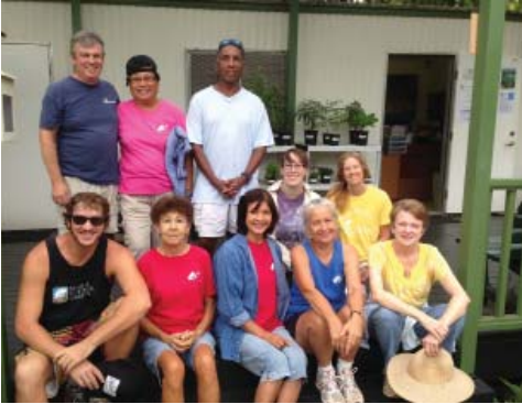
MNBG's Weed & Pot Club pose for a photo before heading out into the Gardens.