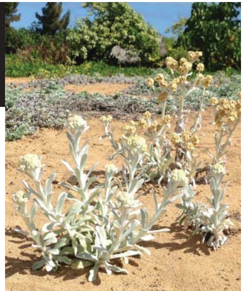
Pseudognaphalium sandwicense var. molokaiense , 'ena 'ena.

Look for 'ena 'ena in the coastal garden, where another Moloka'i species, the alula, can also be seen in full bloom.