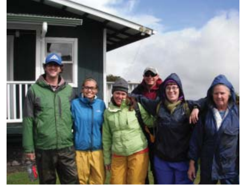
The Weed & Pot Club volunteers at the Hakalau Forest Reserve in January 2013.