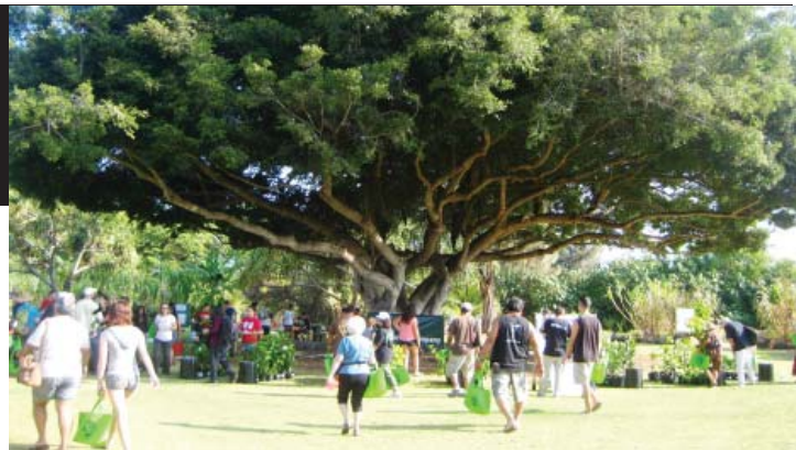
Celebrating Hawaiian trees at MNBG

Guests learned about the connection between trees, watersheds and native habitats, as well as the benefits of urban trees in our community by viewing the displays and storyboards brought in by our fellow Maui conservation organizations. These included the County of Maui's Arborist Committee, Native Hawaiian Plant Society, Community Work Day Program, Haleakalā National Park, Leeward Haleakalā Watershed Restoration Partnership, East Maui Watershed Partnership, and the West Maui Mountain Watershed Partnership.