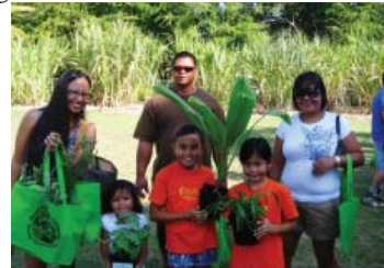
Happy new owners of Hawaiian trees!