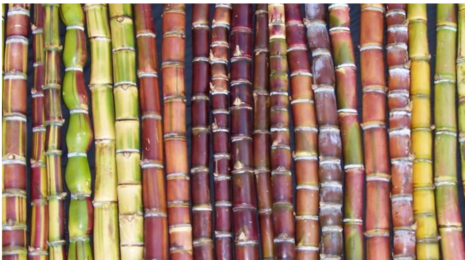
Some of the many varieties of Hawaiian Sugarcane featured at Maui Nui Botanical Gardens.