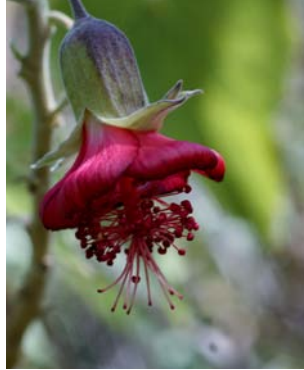
Ko'olua'ula Abutilon menziesii Endemic, Endangered