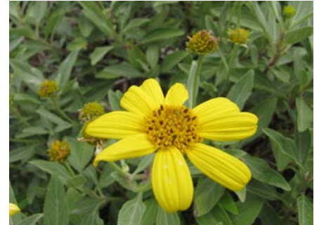
Nehe (Melanthera lavarum) blooms at Maui Nui Botanical Gardens.