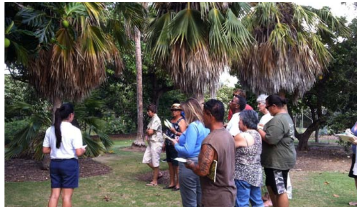
'Iwalani noted that parts of 'ulu (breadfruit) trees were used to heal cuts, chapped skin, scratches, and sores around the mouth.