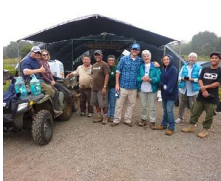
The Weed & Pot club volunteered at the Hakalau Forest Reserve on the Big Island this Summer.