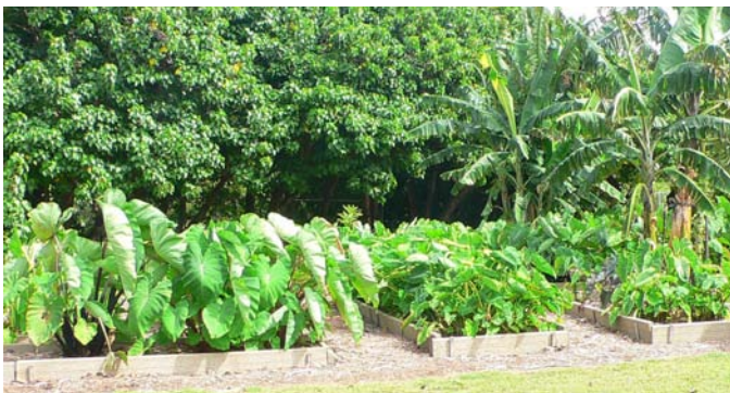
MNBG's kalo collection in raised beds, 2009